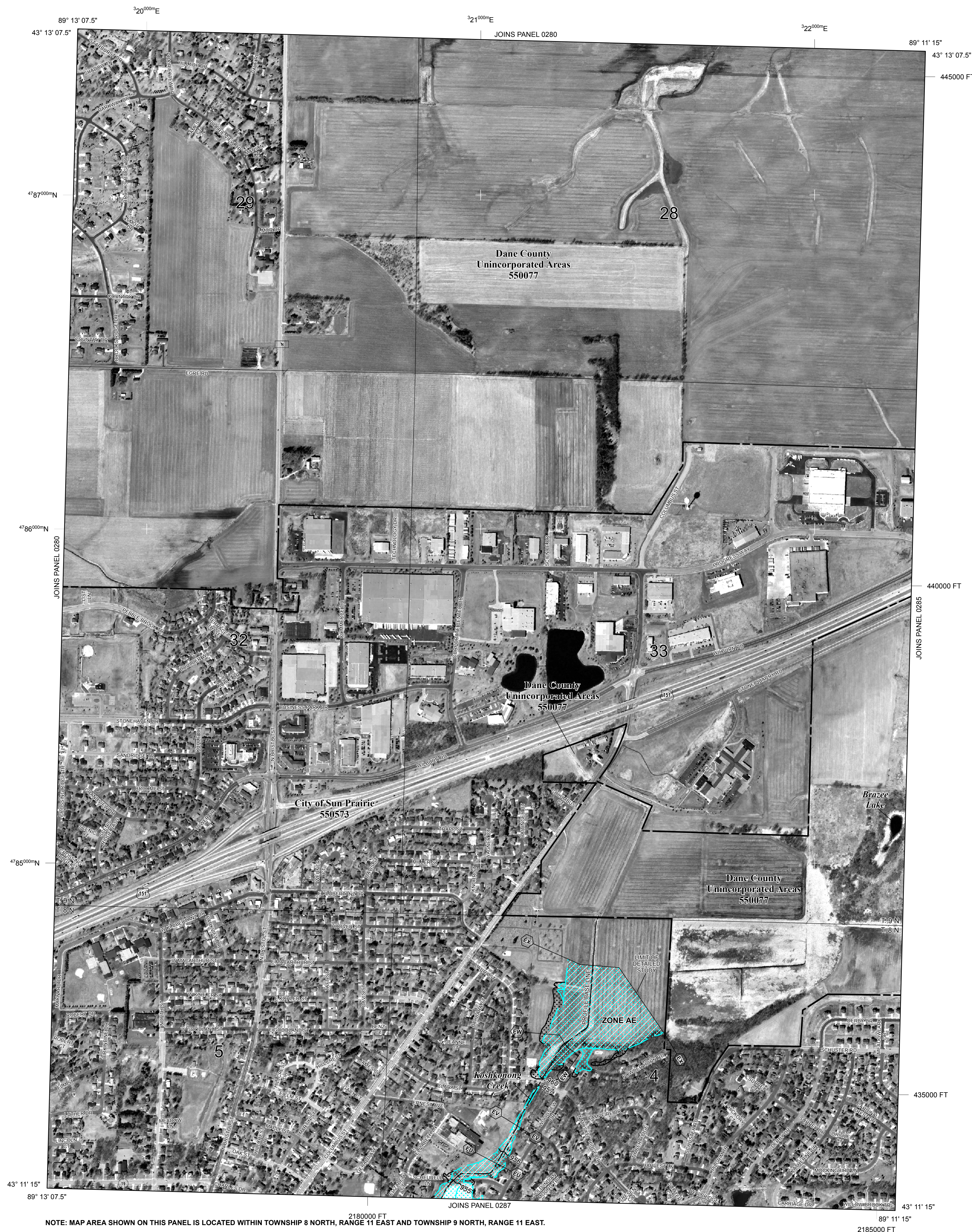
NOTE: MAP AREA SHOWN ON THIS PANEL IS LOCATED WITHIN TOWNSHIP 8 NORTH, RANGE 11 EAST AND TOWNSHIP 9 NORTH, RANGE 11 EAST.

If you have questions about this map , how to order products, or the National Flood Insurance Program in general, please call the FEMA Map Information eXchange (FMIX) at 1-877-FEMA-MAP (1-877-336-2627) or visit the FEMA website at http://www.fema.gov/business/nfp .